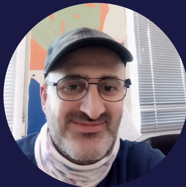
Giorgi the boss

There are many people coming and going to the office, but some have an almost constant office presence, and its most likely the volunteers will work with them!